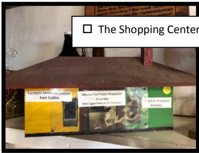
The Shopping Center