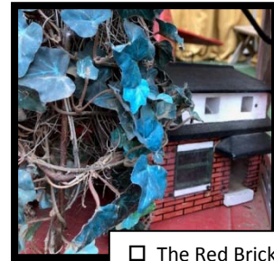
The Red Brick Condo