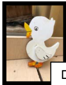
How many Ducks? ____ Hint: They all may not look like this one.