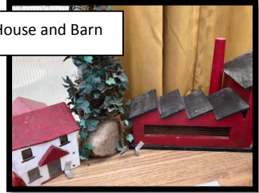
The Farm House and Barn