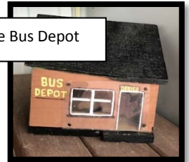
The Bus Depot