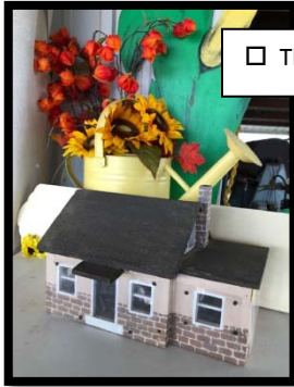
The Country Home

Check off the tiny town building as you find them. They may and may not be in the places pictured in the background. Things move around at the farm. Sometimes we know it and sometimes we don't. Find 10 and get a High Five and a candy from the Trick or Treat bowl.