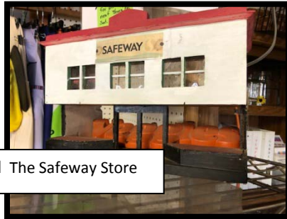
The Safeway Store